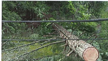
Figure 2 A tree took down a power line in Saanich, B.C. during a windstorm that swept across the South Coast in January. B.C. Hydro has some of the highest densities of trees per kilometre of power line in North America. (CHEK News)

But customers should have flashlights, batteries, a first aid kit, water and non-perishable food on hand in case the lights go out, it says.