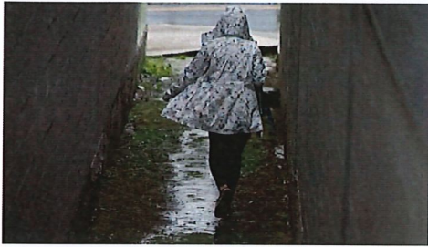
Figure 1 A person walks through puddles during a rainstorm in Vancouver, B.C. on Friday, September 17, 2021.

The Canadian Press · Posted: Sep 17, 2021 8:41 AM PT | https://www.cbc.ca/news/canada/british-columbia/weak-trees-fall-storms-power-outages-1.6179679