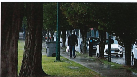
Figure 3 Rain pours down in Vancouver, B.C. on Friday, September 17, 2021.

It notes the duration of blackouts has been declining.